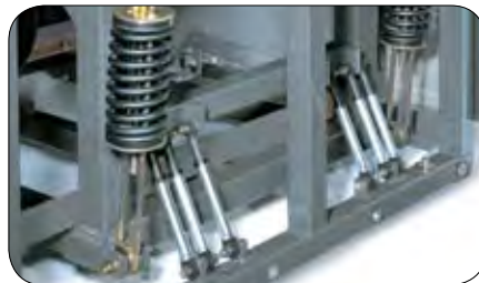
Continental high-performance washers feature an exclusive AquaFall system that significantly reduces water consumption (top). Continental high-performance washers feature a heavy-duty suspension system, allowing for easy, bolt-free installation and high G-force extraction speeds.

laundries. The controls allow individual programmability of wash variables including water levels, wash temperature and cycle times. This enables maximum efficiency according to the load type and eliminates unnecessary water consumption, processing steps and chemical usage.