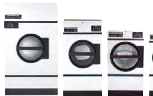
Continental's complete line of laundry products not shown. Continental washer-extractors.

Continental products are designed to work together toward improved efficiency and